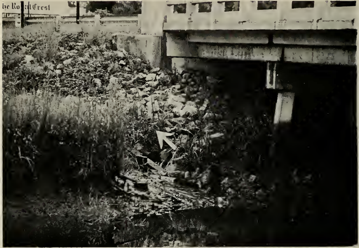
FIG. 3. View of the type locality of Corophium aquafuscum new species from across Riceboro creek.

L., Lileopsis chinensis (L.), and other marsh vegetation. However, on several occasions at "Crossroads," near the headwaters of Riceboro Creek (about 2 miles west of the type-locality), specimens were found in sand-covered tubes attached to submerged logs and vegetation.